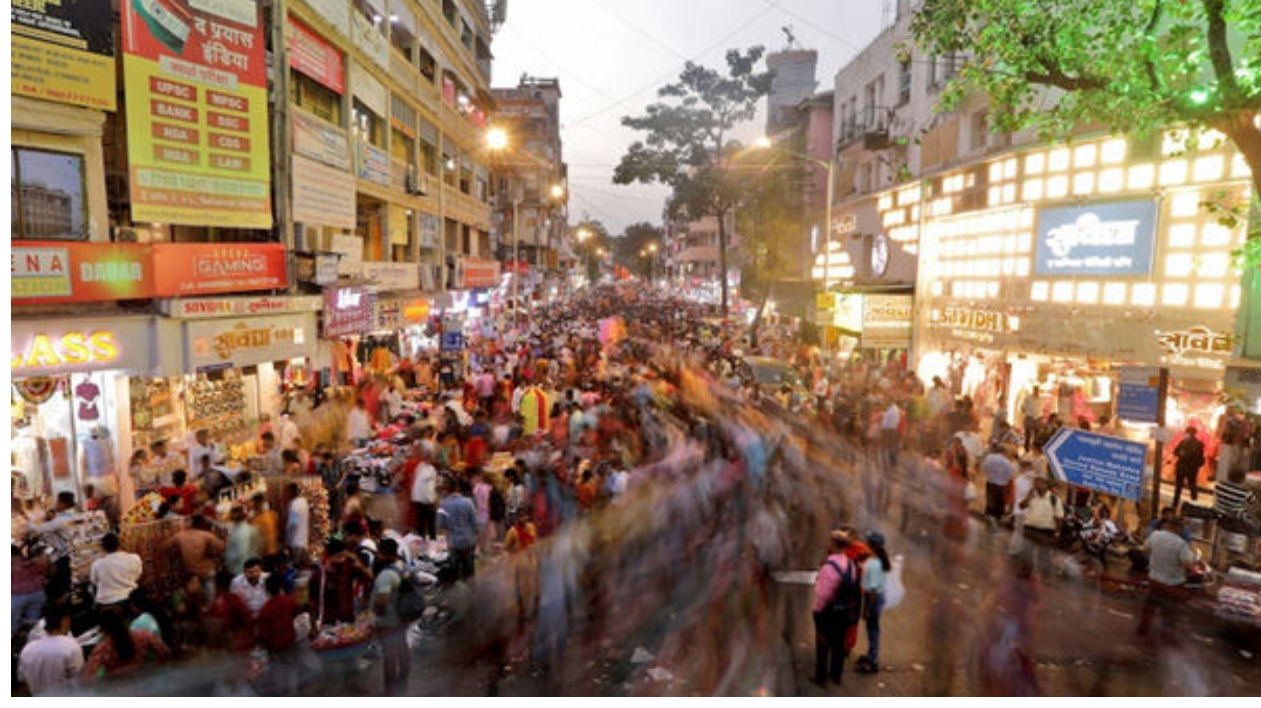
TPN Correspondent | Delhi

India has emerged as the fourth most equal country globally, according to the latest World Bank report, marking a significant milestone in the nation's economic and social journey. The report highlights a sharp