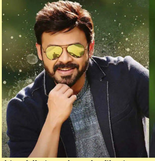
thing falls into place, the film is expected to go on floors in August, with a potential release in Summer 2026.

Though details remain under wraps, the project is reportedly progressing behind the scenes, with pre-production work quietly underway. If every-