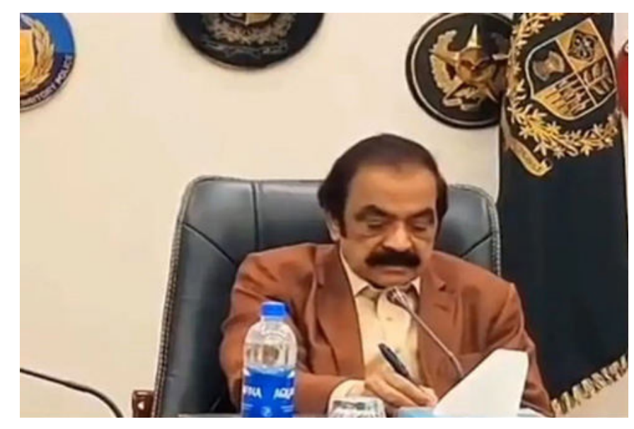
TPN Correspondent \mid Delhi

A senior Pakistani politician has revealed that during the recent India-Pakistan military standoff, the Pakistan Armed Forces had only 30 to 45 seconds to determine whether an incoming Indian BrahMos missile carried a nuclear warhead—a window that could have triggered a catastrophic response.