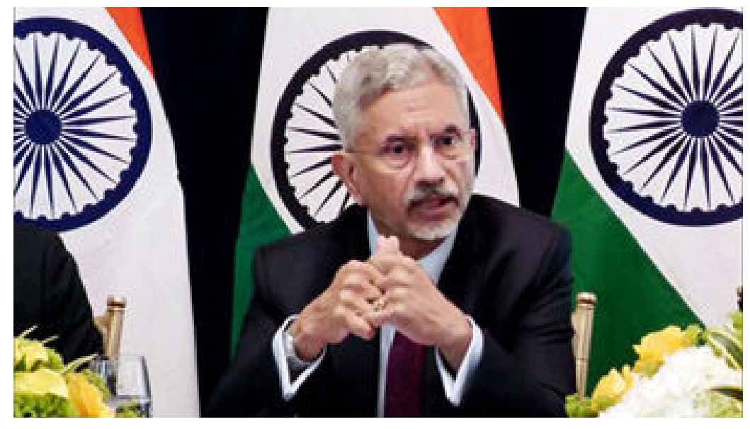
TPN Correspondent | Delhi

External Affairs Minister Dr. S. Jaishankar on Thursday responded to a US Senate bill proposing a 500 percent tariff on oil imports from countries trading with Russia, stating that India will closely watch developments that may affect its energy security.