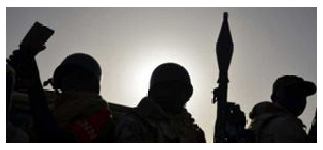
TPN Correspondent | Delhi

India has expressed deep concern following the abduction of three Indian nationals in Mali amid a surge of terror attacks in the West African nation. The three Indians, employed at the Diamond Cement Factory in Kayes, were forcibly taken hostage during a coordinated armed assault on July 1, according to the Ministry of External Affairs (MEA).