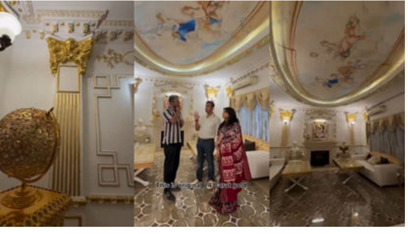
while the balcony provides a sweeping view of the estate.

The centerpiece of the home is a stunning spiral staircase, straight out of a Bollywood film. With gold curves and a grand chandelier overhead, it adds dramatic flair and elegance. The living room opens to a beautifully landscaped garden, complete with fountains and blooming flowers,