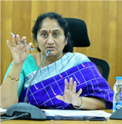
Under the P-4 model, 10% of the economically privileged population will support 20% of the underprivileged. Minister Savi-

The Andhra Pradesh government is set to revamp Backward Class (BC) hostels under the prestigious P-4 model, announced BC Welfare Minister S. Savita. As part of this transformation, the government seeks support from donors and beneficiaries of the NTR Foreign Education Scheme who have reached high positions globally. The initiative aligns with Chief Minister N. Chandrababu Naidu's Swarna Andhra @2047 Vision, aiming to eliminate poverty and ensure inclusive development.