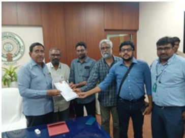
minister to support the establishment of a world-class Press Club, which would serve as a hub for media professionals across the region. Highlighting Amaravati's significance as a planned

In a significant move towards strengthening media infrastructure in the People's Capital, a delegation of Press Club Amaravati representatives met Urban Development Minister Minister P. Narayana at the Secretariat on Friday. During the meeting, the delegation appealed to the minister to allocate land for the construction of a dedicated Press Club in Amaravati. The journalists urged the