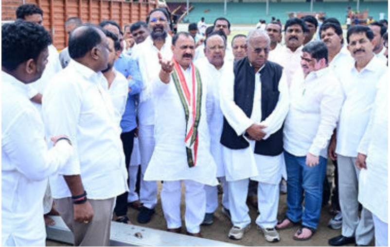
The July 4 meeting is expected to energize Congress cadres ahead of upcoming local body polls and reinforce the party's campaign against the BJP at the national level.

to Hyderabad on July 4 to lead a massive public gathering against the fascist Modi regime. This is a historic occasion where the voice of grassroots Congress workers will rise." He also took a swipe at Union Home Minister Amit Shah's recent Hyderabad visit and BJP's foreign policy posturing. "You stop midway when Trump says India will wage war on Pakistan. You claim to be tough on Leftist movements, but don't even conduct proper dialogue. What kind of leadership is this?" he asked, criticizing the BJP's double standards.