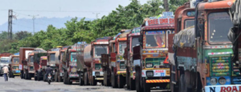
TPN Correspondent | Andhra Pradesh

In a much-needed relief to the transport sector, the Andhra Pradesh government has slashed the green tax imposed on goods and public transport vehicles. The decision was taken in the cabinet meeting held in Amaravati on July 9, chaired by Chief Minister N. Chandrababu Naidu. This marks a key move in fulfilling the coalition government’s election promise to ease the financial burden on motorists. The cabinet has approved an ordinance to revise the green tax, aligning it with Telangana’s structure. Until now, transport vehicle owners were paying up to ₹20,000 annually due to changes implemented by the previous YSRCP government. Now, the tax has been rationalized to ₹1,500 per year for vehicles aged 7–12 years and ₹3,000 for those older than 12 years. This applies to all public and goods transport vehicles. Under the earlier policy, lorry and public vehicle owners were burdened with quarterly taxes that escalated depending on the vehicle’s age. For example, vehicles between 7–10 years had to pay half a quarter’s tax, those aged 10–12 years paid one quarter’s tax, and vehicles above 12 years had to pay two quarters’ tax. This led to widespread frustration in the trans-