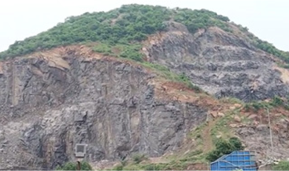
TPN | V.V.S Madhu Babu

NTR District: A massive illegal mining racket is unfolding in broad daylight in Paritala village of Kanchikacharla mandal, NTR district, where crushers and quarry owners are reportedly plundering natural wealth worth crores without fear of consequence. Under the guise of legal leases, entire hillocks are being dug up, with authorities turning a blind eye.