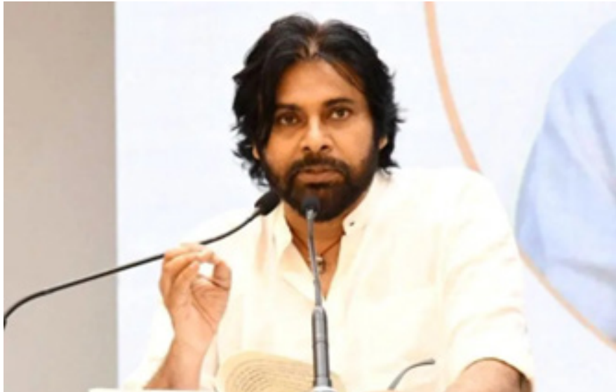
TPN Correspondent | Kadapa