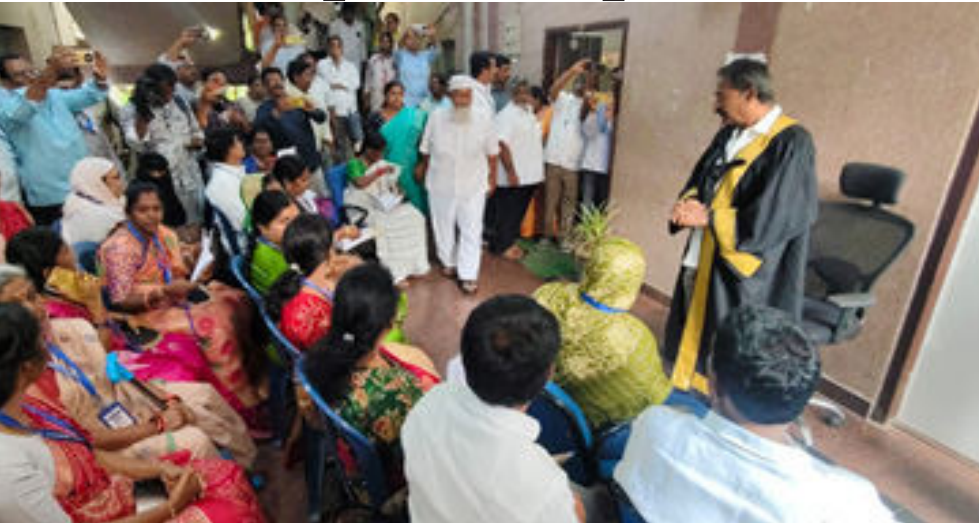
General meeting was held outside the conference hall under the chairmanship of the Mayor