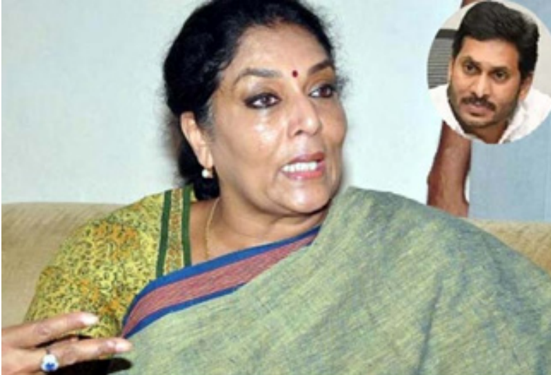
TPN Correspondent | Andhra Pradesh Amaravati: Rajya Sabha member and senior Congress leader Renuka Chowdhury has issued a bold challenge to YSRCP president Y.S. Jagan Mohan Reddy, daring him to visit the