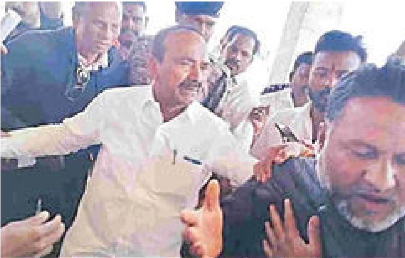
The FIR was filed in January 2025 by the Pocharam IT Corridor police after Rajender allegedly slapped a realtor while accusing him of encroaching on land reserved for the poor