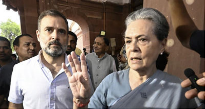
Congress president Mallikarjun Kharge recently stated that the party would not be intimidated by what he called “a spirit of vendetta,” referring to the charges against Sonia and Rahul Gandhi in the Nation-

to AJL, which was later transferred to Young Indian for a nominal sum of Rs 50 lakh. This arrangement allegedly allowed Young Indian to take control of AJL and its valuable properties. The ED accuses the Gandhis and other Congress figures of laundering around Rs 988 crore through this scheme. The Congress party has strongly denied the allegations, accusing the ED and the Centre of using investigative agencies as tools of political vendetta.