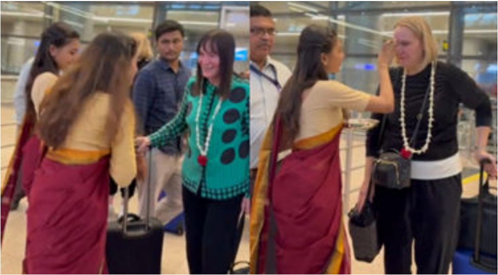
the day with various agencies to finalize details of the week-long pageant and ensure a flawless experience for participants and global guests.

events and cultural tours where contestants will be participating. She will also interact with key stakeholders to assess the city's infrastructure, hospitality readiness, and coordination plans across departments involved in the pageant. The Telangana government is treating the event as a prestigious global opportunity to showcase the state's cultural vibrancy and hospitality on an international platform. Official discussions are scheduled throughout