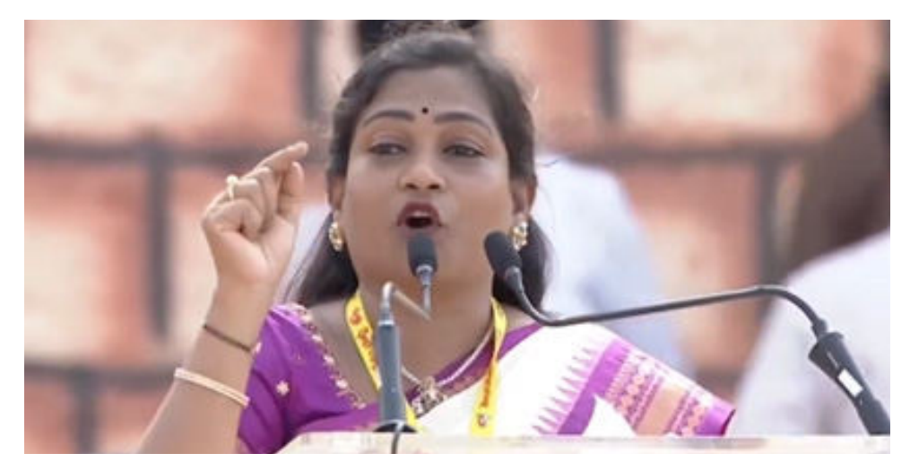
TPN Correspondent | Kadapa