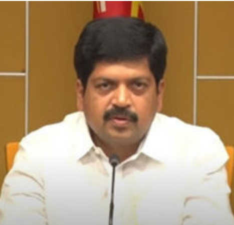
TPN Correspondent | Andhra Pradesh

Minister says SIT probe into liquor scam is making the former CM nervous