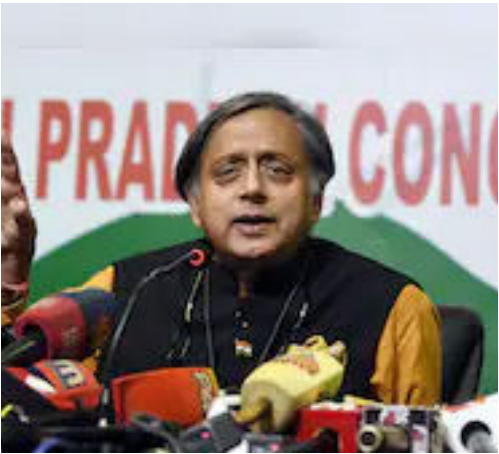
"Not A Spokesperson": Shashi Tharoor After Congress' 'Lakshman Rekha' Remark TPN Correspondent | Delhi

Congress MP Shashi Tharoor clarified on Thursday that his recent remarks on the India-Pakistan conflict were made in his personal capacity and not on behalf of the Congress party. The Lok Sabha MP from Thiruvananthapuram emphasized that he was speaking as "an Indian and a proud citizen" when he shared his perspective on the situation during interviews with international media.