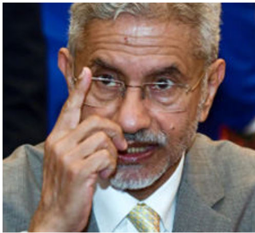
"Complicated, Nothing Decided Till": S Jaishankar On India-US Trade Deal TPN Correspondent | Delhi

Authorities are expected to release more information once the ongoing operation concludes and the area is fully secured.