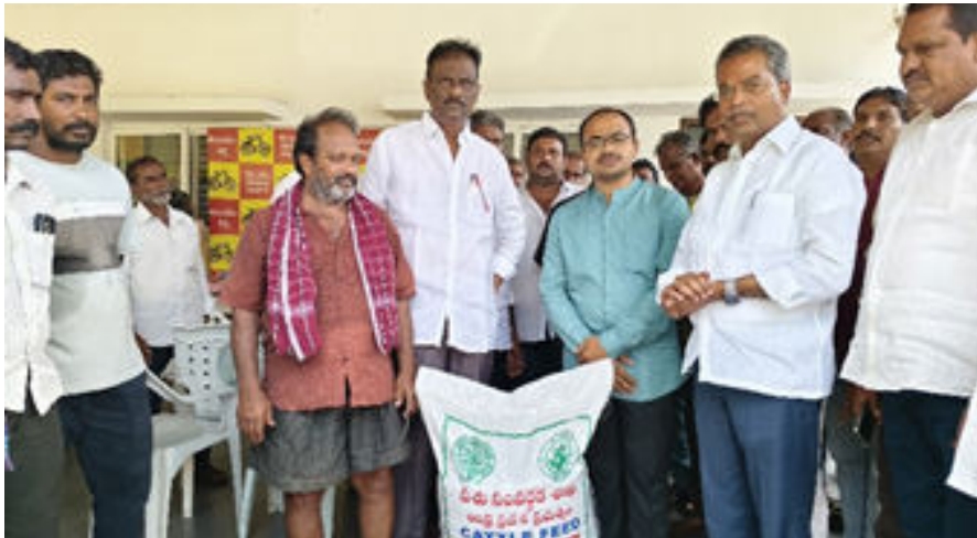
fodder with 20 percent protein content is being provided to livestock farmers. The initiative is specifically aimed at small, marginal, and white ration card-holding farmers through the Animal Husbandry De-