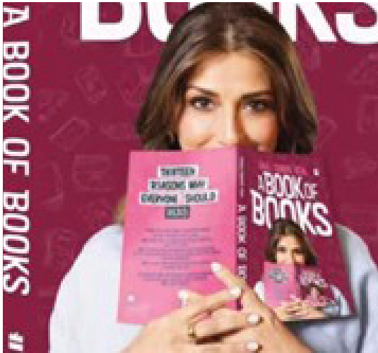
A Book of Books is priced at ₹599 and is now available for pre-order.

Award-winning actress and author Sonali Bendre Behl is set to release her second non-fiction book, A Book of Books, on April 23, announced HarperCollins India. Celebrating her enduring love for reading, the book presents ‘13 reasons why everyone should read’, along with thoughtful recommendations for all age groups and genres. In her statement, Bendre said, “Reading has been my constant companion... this book is a guide, a journal, and a friend in every reader’s journey.” Following her 2015 debut The Modern Gurukul, this new work continues her literary mission through Sonali’s Book Club, a thriving online reading community.