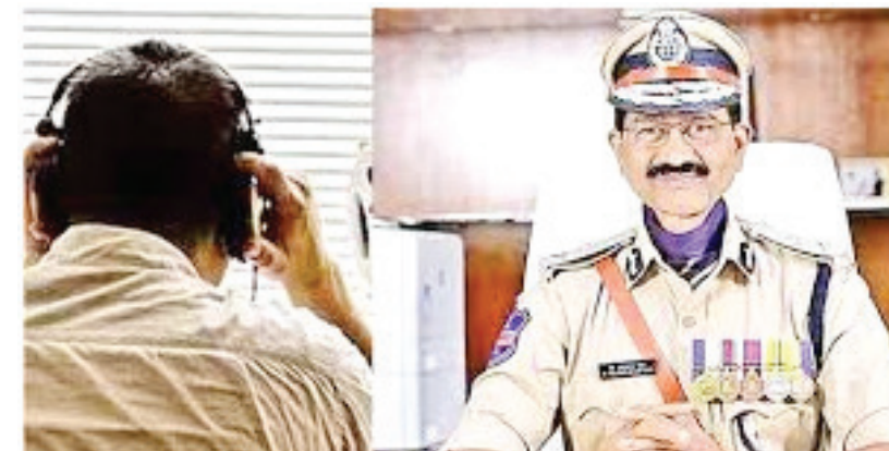
decided to issue fresh notices for his appearance to probe the case further.

The SIT team had earlier questioned him for over six and a half hours, but they were unable to gather the desired information. As a result, the SIT has