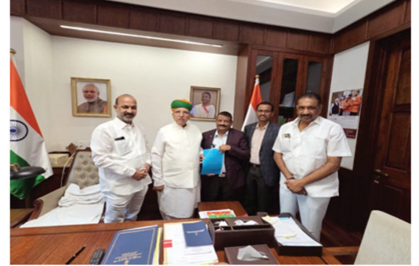
This development is expected to provide significant opportunities for legal education in the region and enhance the academic offerings at Sathavahana University.

Arjun Meghwal assured the delegation that Sathavahana University would be granted approval for the Law College as soon as possible. He directed the concerned authorities to ensure that the college begins operations in the 2025-26 academic year.