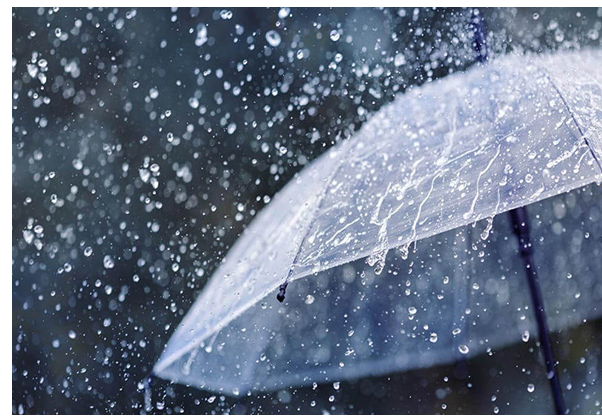
gusty winds, lightning, and possible heavy

TPN Correspondent | Hyderabad Telangana residents, who have been enduring intense heat in recent days, can expect some relief with the forecast of rain over the next five days. According to the Hyderabad Meteorological Center, light to moderate rainfall is expected across the state. The rains are anticipated due to the combined effects of increased surface heat and the impact of a weather system. On Wednesday and Thursday, the northern and western regions of Telangana are likely to experience thunderstorm conditions, with