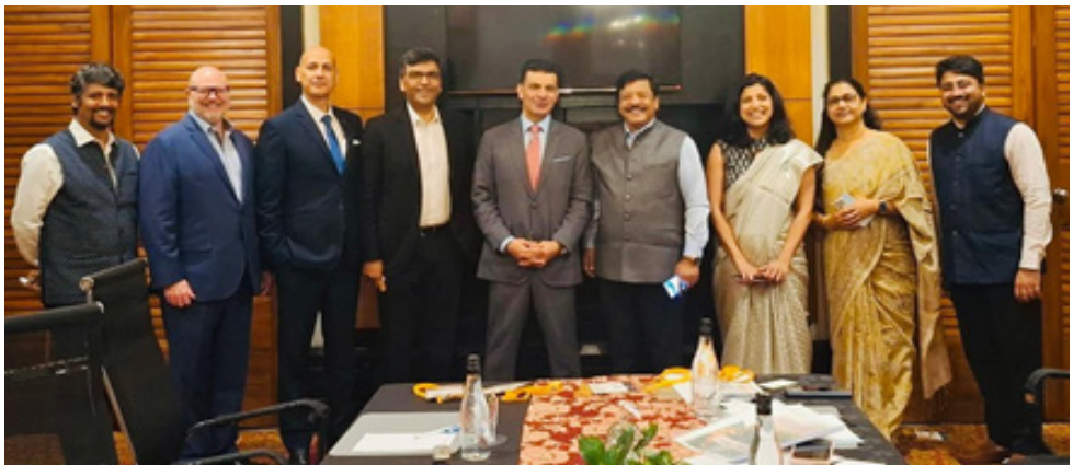
called upon entrepreneurs to seize Andhra Pradesh’s transformation into the opportunity and become a part of a premier tourism destination.

working on multiple tourism circuits including heritage, spiritual, eco-tourism, and coastal tourism, which will open up new investment avenues. The Minister also said that a single-window clearance system is in place to ease the process for prospective investors. Stressing on the recent interest shown by reputed hospitality brands, Durgesh revealed that discussions are ongoing for several large-scale projects, which could significantly boost local employment and revenue. He assured that the state will extend full cooperation to investors and