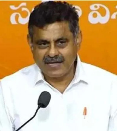
He mentioned that Congress had al-