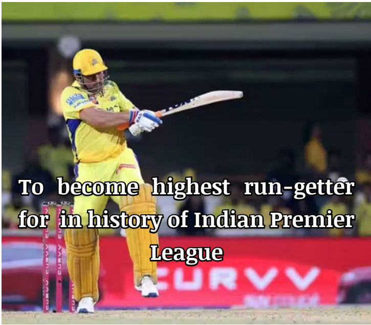
To become highest run-getter for in history of Indian Premier League