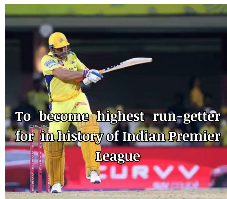
To become highest run-getter for in history of Indian Premier League