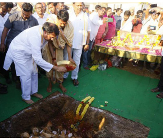
TPN Correspondent | Kakinada Preparations are in full swing for the Jana Sena Party formation day meeting, set to