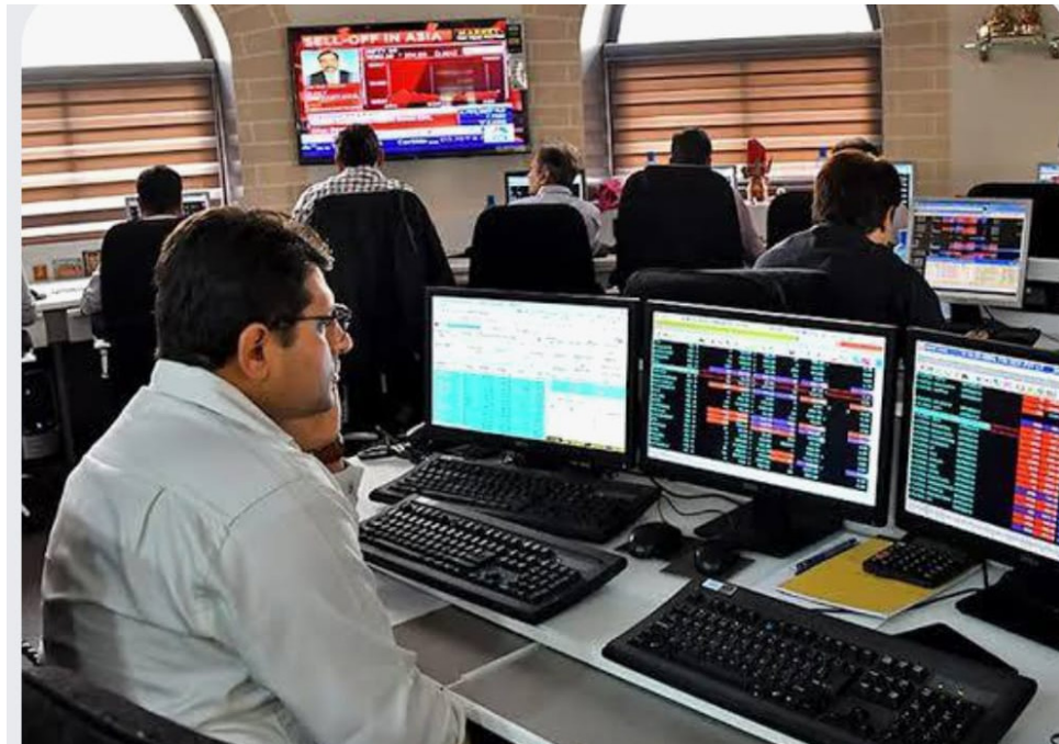
opened at 23,600, touched a low of 23,450 and a high of 23,450. It closed

The BSE Sensex, which closed at 77,606 in the previous session, opened at 77,690 on Friday. It touched an intraday low at 77,185. It reached an intraday high at 77,766. It ended at 77,414, down 191 points. The NSE Nifty, which