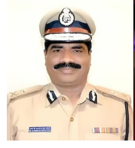
TPN Correspondent | Bengaluru

CBI are investigating potential links to international smuggling operations