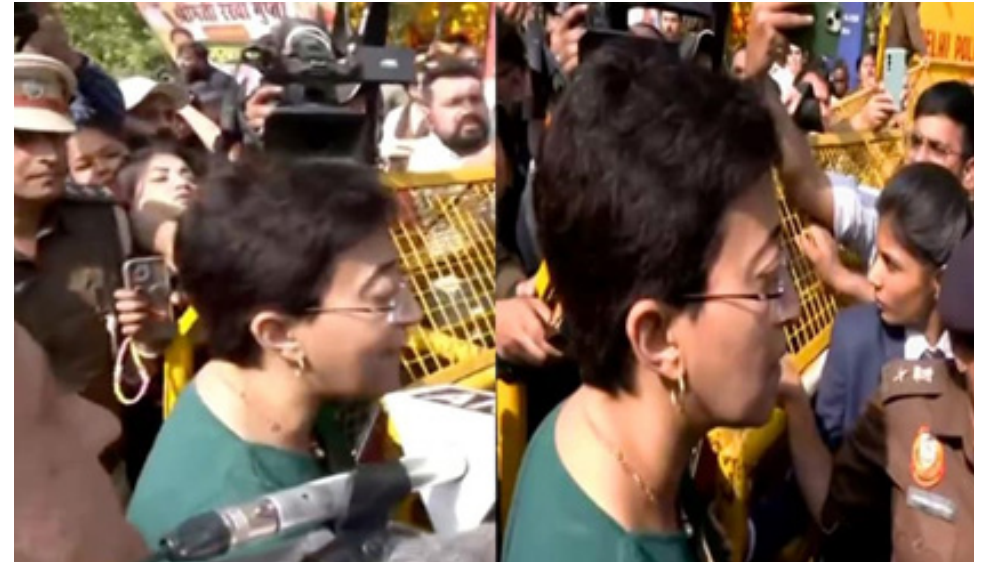
TPN Correspondent | New Delhi

MLAs were suspended for three days for disrupting the LG's address.