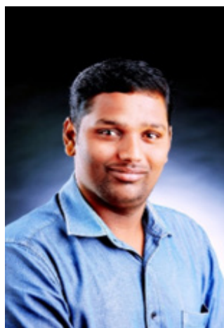
Sagar Vanaparthi, Sr Journalist & Political Analyst.

Currently, women make up only 15.2% of the Lok Sabha and 13% of the Rajya Sabha. While this is an improvement from the 5% representation in the first Lok Sabha, it is still lower than many other countries. According to the United Nations, Rwanda (61%), Cuba (53%), and Nicaragua (52%) lead in women's representation.