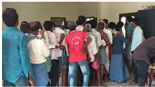
for a more reliable and sufficient supply to ensure their crops can thrive.

Recently, in the Narsimhulapet mandal of Mahabubabad district, farmers were seen waiting in long lines at urea distribution centers. They expressed their dissatisfaction over the inadequate supply of urea at PACS (Primary Agricultural Cooperative Societies). Farmers voiced concerns, stating that they were being given urea in limited quantities, which was insufficient for their needs. They questioned how they could expect a good harvest under such conditions, urging