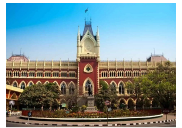
Calcutta High Court Chief Justice Recuses Himself from R.G. Kar Rape and Murder PIL Case TPN Correspondent | J&K

As Arunachal Pradesh and Mizoram celebrate their Statehood Day, the leaders' messages reflect a commitment to continued development, harmony, and the celebration of the unique cultural identities of these two states.