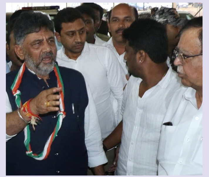
K N Rajanna Slams D K Shivakumar, Accuses Him of Misusing High Command's Name

presence of cattle on roads was causing fear among residents. The Chief Minister's office took swift action, instructing local authorities to prevent stray cattle from entering state highways. The town panchayat has been tasked with taking the cattle to designated cow sheds. CM Siddaramaiah emphasized that he is always ready to listen to the public's concerns and has urged people to bring local issues to the government's attention via social media, ensuring that solutions are found for all districts across Karnataka.