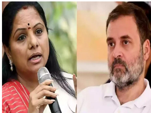
Students Forced to Walk for Mid-Day Meals: Kavitha

She criticized the Congress party for failing to implement the Warangal Farmer Declaration, which was announced by Rahul Gandhi before the elections. "He knew farmers would question him about the unfulfilled promises, so he chose to flee instead of facing them," she remarked. Kavitha asserted that the BRS would continue to hold Congress accountable until all election promises were fulfilled.