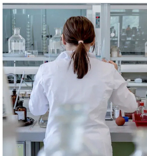
field of genetics.