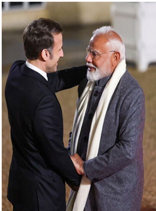
opening of a new consulate. The communi-

Upon arrival in Paris, PM Modi was greeted enthusiastically by members of the Indian diaspora, with some even singing 'Hare Krishna' in celebration. One member of the community shared their joy, stating, "Today is my birthday, it's a big day for me and he (PM Modi) blessed me." Another expressed pride in the Prime Minister's visit, noting the importance of the AI summit and the