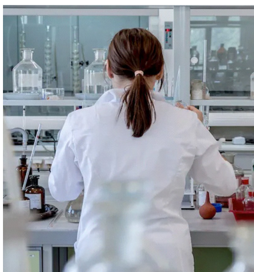
field of genetics.