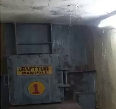
of increased water flow.

TPN Correspondent, Hyderabad : Concerns are mounting over the safety of the Srisaillam Left Bank Hydropower Station, as water leakage has been reported near the draft tube on the zero floor of the plant. The issue has raised alarms among engineers and experts, who fear significant damage if immediate action is not taken. The Srisaillam and Nagarjuna Sagar projects, constructed on the Krishna River, play a vital role in providing electricity, irrigation, and drinking water to the Telugu states. While the Nagarjuna Sagar project is built with stone and is considered structurally robust, the Srisaillam project's location on riverbanks has made it more vulnerable, especially during periods