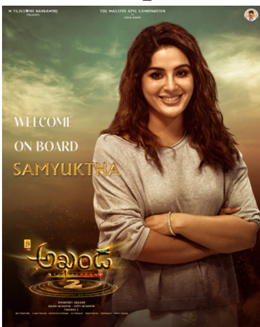
The film crew has already started shooting in parts of Andhra Pradesh, includ-

The highly anticipated sequel Akhanda 2 has created a buzz among fans, especially with the recent reveal of a new poster featuring Samyuktha as the leading lady opposite Nandamuri Balakrishna. Directed by Boyapati Srinu, Akhanda 2 is set to continue the high-octane saga that began with the blockbuster Akhanda , which became a major hit due to its intense action and gripping storyline.