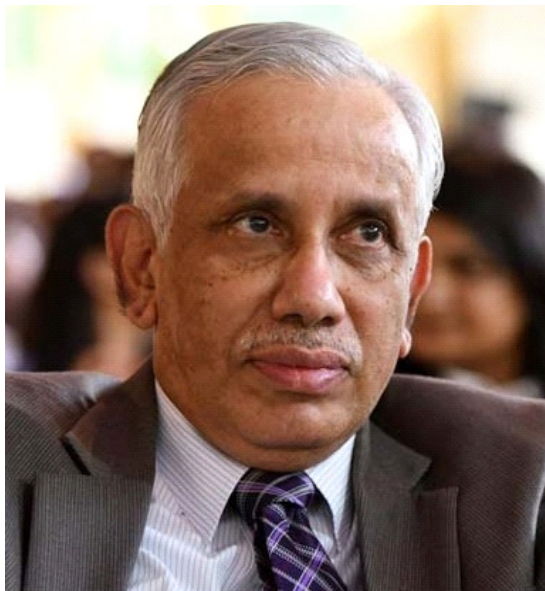
TPN, Andhra Pradesh: The retirement age for judicial officers in Andhra Pradesh has

officially been raised from 60 to 61 years following approval from Governor Justice Abdul Nazeer. The amended law has been published in the state gazette under the guidance of the law department, marking its formal implementation.