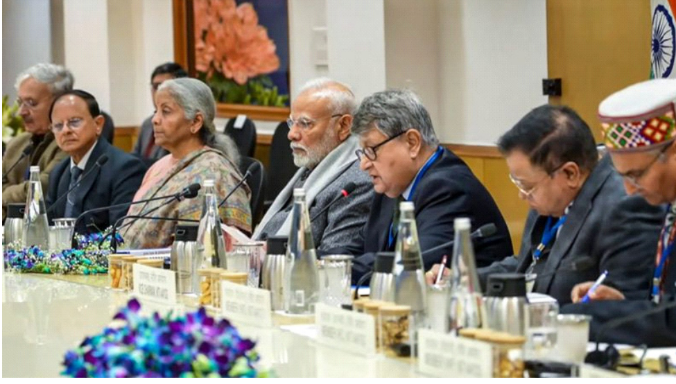
the coming fiscal year and addressing key challenges faced by the country.

Union Finance Minister Nirmala Sitharaman is scheduled to present the Budget in the Lok Sabha on February 1, 2025. This budget will be crucial in setting the economic direction for