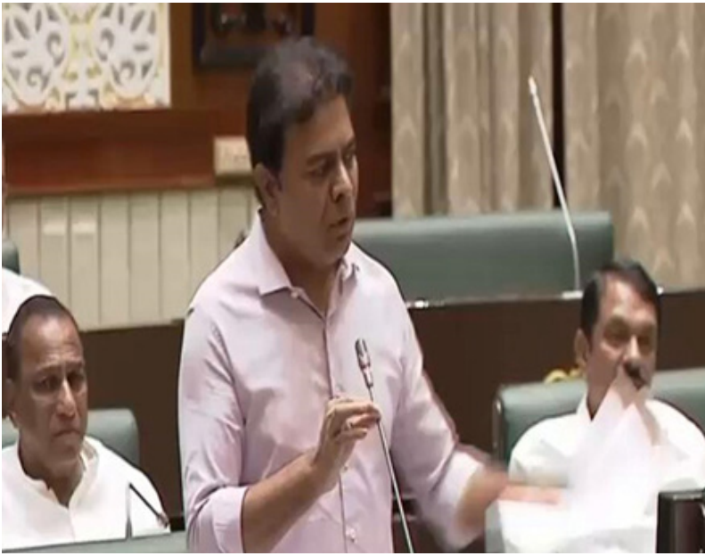
TPN , Telangana : BRS Working President K.T. Rama Rao (KTR) criticized the Congress government in the Telangana Assem-

Congress Owes Farmers Rs. 26,775 Crore... KTR Demands Immediate Arrears Clearance