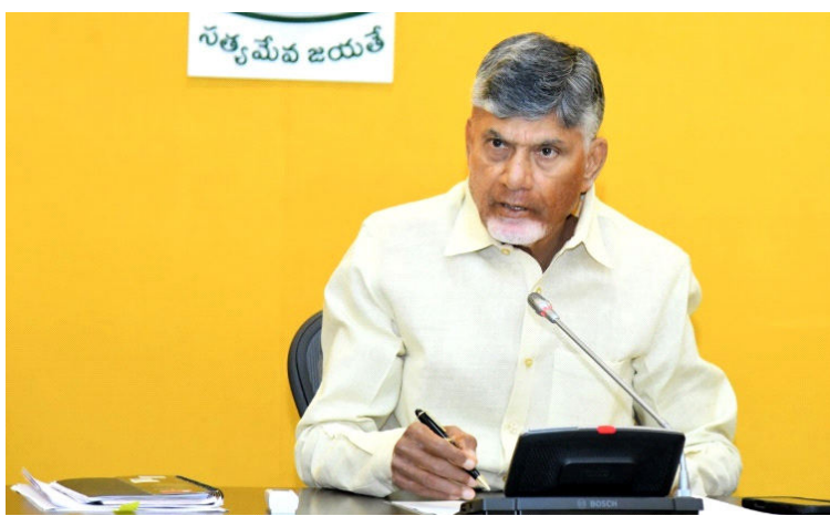
TPN Correspondent Andhra Pradesh, Dec 15

Amid growing speculation about the timing of joint elections, Andhra Pradesh Chief Minister Chandrababu Naidu has clarified that even if the Joint Election Bill is passed, Jamili (joint) elections will only be held in 2029, not 2027. This comes as the Central Cabinet has already approved the concept of Jamili elections, and the Jamili Election Bill is expected to be introduced in Parliament on Monday, with an anticipated approval soon after. Naidu, addressing concerns over the political discourse in the state, criticized YSRC leaders for claiming that joint elections would occur as early as 2027. He accused them of not fully understanding the issue and using it to serve their own political interests. He pointed out that the public has grown increasingly distrustful of YSRC leaders' statements, dismissing their remarks as merely a source of amusement for the people. Additionally, Naidu reiterated his party's support for the "One Nation, One Election" initiative, while stressing that the timeline for the joint elections remains set for 2029. He also emphasized the importance of promoting the "Swarna Andhra Vision 2047" document among the people, particularly in educational institutions, to foster a better understanding of the state's future development goals.