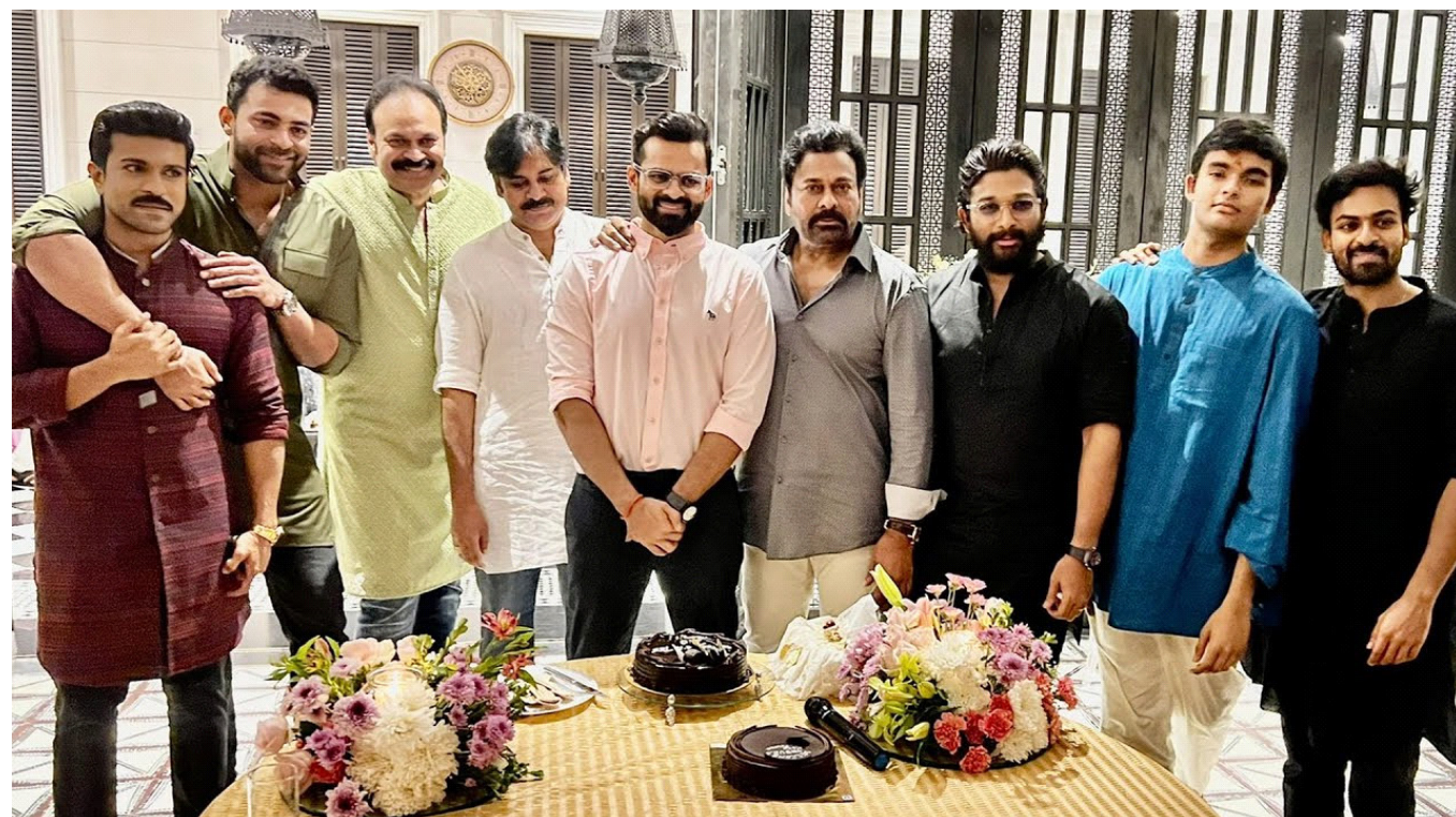
TPN Correspondent Hyderabad, Dec 14

Allu Arjun's recent arrest in connection with the stampede incident at Sandhya Theatre on the release day of Pushpa 2 has sparked a wave of reactions from fans and celebrities alike, bringing the Mega family closer together. The arrest, which followed the trag-