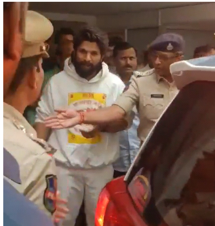
TPN Correspondent Hyderabad, Dec 14

Allu Arjun, the popular actor known for his role in Pushpa, was arrested in connection with a stampede that occurred near Sandhya Theatre during the release of his film Pushpa 2. Tragically, a woman lost her life in the incident. The police arrived at Allu Arjun's residence without prior notice, requesting his cooperation in the ongoing investigation. The arrest, which had not been disclosed beforehand, involved the police asking Allu Arjun to accompany them without being given time to change clothes. However, the actor remained calm and composed, stopping the police and taking a few moments to drink coffee while conversing with his father. He also encouraged his distressed wife and shared a brief moment of affection with her before agreeing to go with the authorities. The entire sequence was witnessed by fans and netizens, who commented on Allu Arjun's poise, drawing comparisons to his Pushparaj character's unwavering confidence in the film. After being taken to Chikkadapalli police station, Allu Arjun underwent medical tests at Gandhi Hospital. Following the tests, he was brought before the Nampally court. After some legal arguments, the court remanded the actor for 14 days. In response, Allu Arjun's legal team filed a quash petition in the High Court to dismiss the case. The court granted conditional bail, postponing the hearing on the petition. The actor's fans are rallying behind him, hoping for a favorable resolution in the case.