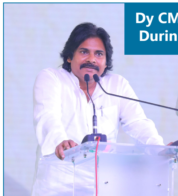
Dy CM Pawan Kalyan Lauds Chandrababu Leadership During Swarnandhra Vision-2047 Document Launch

Chandrababu concluded by praising Pawan Kalyan's consistent support and shared aspirations for a prosperous Telugu nation. "Pawan Kalyan often reminds me, 'Sir, we only saw stones, but you saw a vision.' This is the power of dreaming big and working with determination."