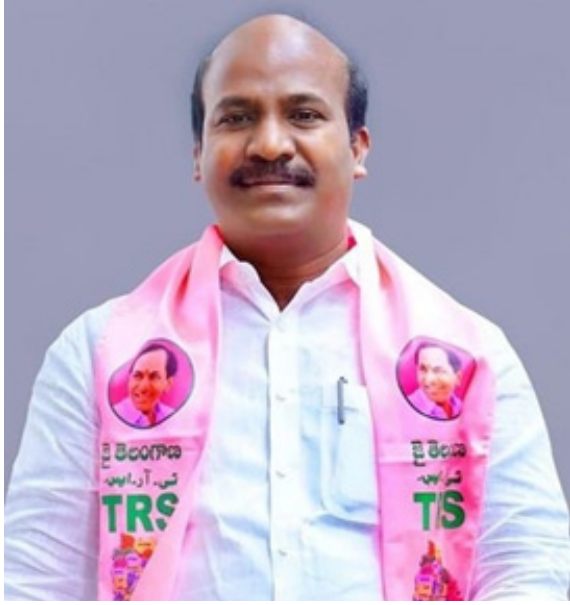
he joined the Bharat Rashtra Samithi (BRS).