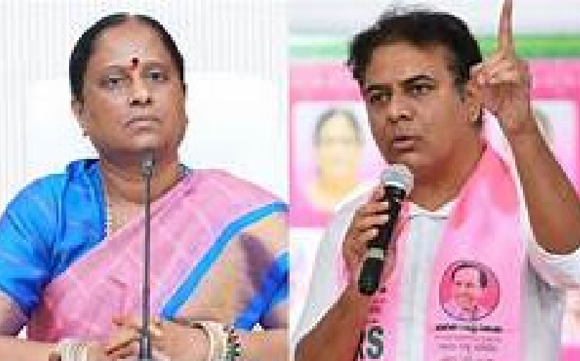
TPN , Hyderabad : BRS Working President K.T. Rama Rao (KTR) has alleged that his honor and reputation have been severely damaged by defamatory comments made by State Revenue

KTR claims Surekha's comments damaged his reputation Court records KTR's testimony for 30 minutes Next hearing scheduled for the 30th of this month