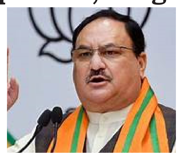
and urging State leaders to meet the target by October 24.

According to party sources, the BJP currently has around 20 lakh members in Telangana, with over 14 lakh of them being existing members. The drive, which was launched with the aim of enrolling 50 lakh new members, has only managed to add 6 lakh new recruits. This has prompted strong criticism from the central leadership, with Nadda expressing frustration over the low numbers